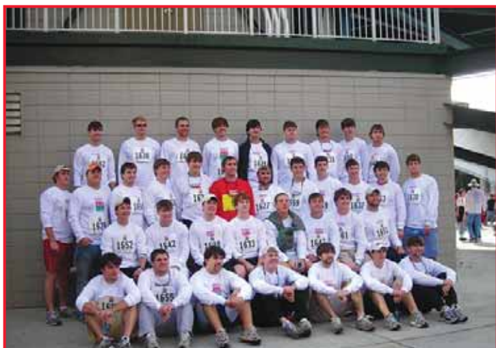
TN Alpha participates in the Buddy's Race Against Cancer