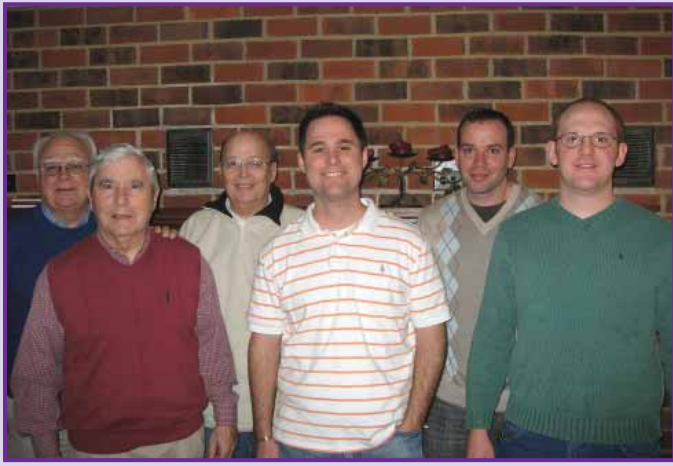
Alumni Volunteers at the 2009 planning retreat