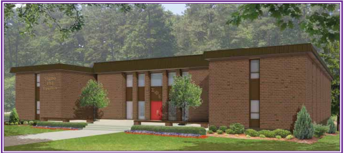
This rendering shows the chapter house with the required renovations

In December 2008, the Tennessee State Fire Marshall inspected all fraternity houses at UT. Sig Ep along with other fraternities were required to take immediate corrective actions before the undergraduates were allowed to return for the spring semester. Each of these items was immediately addressed and our undergraduate brothers returned to the house for the spring semester. However, the Fire Marshall also identified additional upgrades required for us to continue to occupy the chapter house. Our options were to either vacate until a new house could be built or make the necessary improvements.